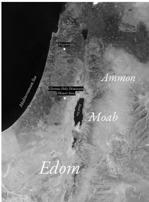
Fig.2 The Glorious Land